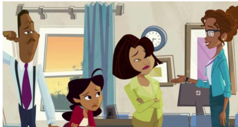
Fans are praising Disney Television Animation for the latest episode of The Proud Family: Louder and Prouder , which handles the autism diagnosis of main character BeBe Proud.